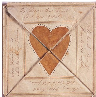
My Dear this heart that you behold / When you these leaves unfold

The poems and verses were written on slips of paper or posted in a newspaper by suitors for Valentine's Day. Verses were also transcribed onto handcrafted love-letters that were folded into puzzle purses as love tokens that were introduced by Pennsylvania-Germans. These puzzle purse love tokens were created on a one foot square of "laid paper" (with laid lines from the paper mold) was folded into a square "purse." The delightful Valentine was decorated with verse and decoration