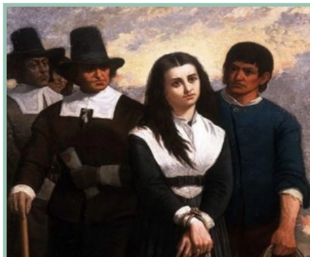
An early depiction of a Colonial woman being led to her execution.

mental illness in the colonies, and depression has been surmised to have been the cause of the murder. Look at these stats: