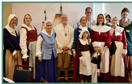
Colony members in Period Dress at the Compact Day Meeting in November!